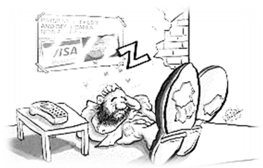
By Kushal "Baggers go digital' - Teekhi Toons

140. PNG is fully committed for the long term to achieving the commitments announced under the Maya Declaration. The first is the goal of reaching two million more underserved low-income people in Papua New Guinea, 50 per-cent of whom will be women. Beyond attaining this first goal, there will remain ample scope for achieving still higher levels of financial inclusion in PNG, thus making financial inclusion an area of financial sector policy that will require priority policy attention for the long-term.