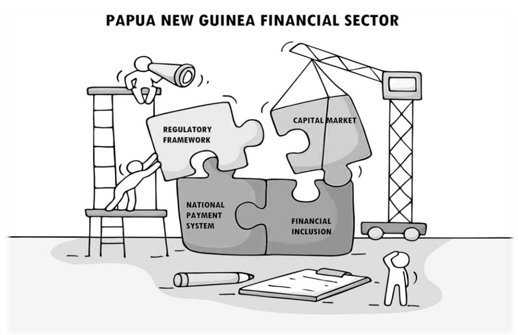
Anonymous Source: "Building the Financial Sector" – Financial Services Sector Review